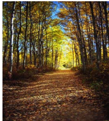
Tall Oaks offers many beautiful walking trails

A. Cabin Housing Option ($225.00) includes three sets of bunk beds in each room of the older cabins. Conference Center Housing Op-